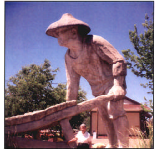
Chinese Coolie with Tourist